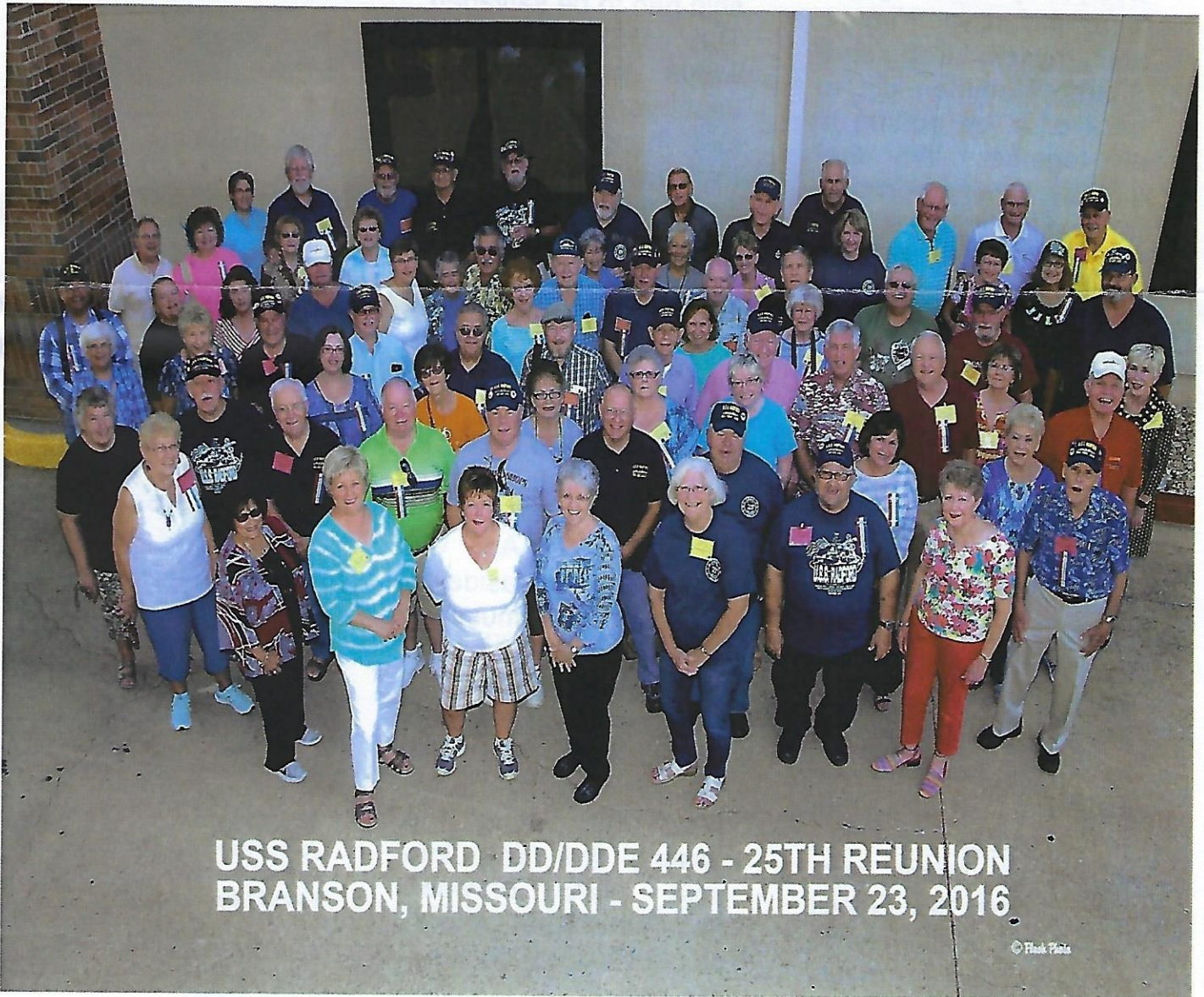
USS RADFORD DD/DDE 446 - 25TH REUNION BRANSON, MISSOURI - SEPTEMBER 23, 2016