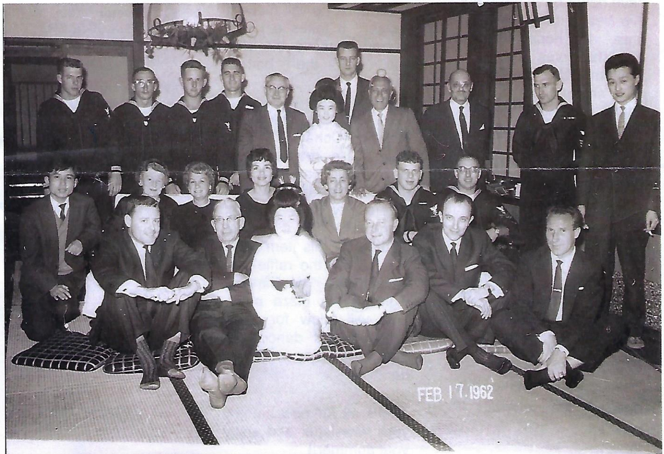
JAPAN GRAY LINE NIGHT TOUR Shiba P. O. Box 109, Tokyo Tel. 591-0778, 1749

APRIL 2015 WWII – KOREA – VIETNAM – COLD WAR “AS LONG AS ONE OF US LIVES, SHE WILL LIVE” www.ussradford.org