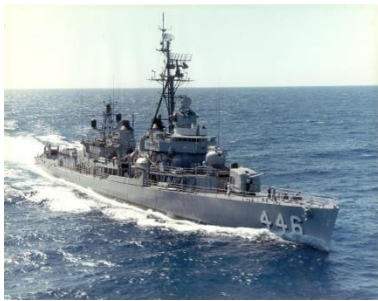
Last cruise – 1969

USS Radford Association 482 Windyville Road Spencer, WV 25276